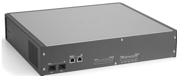
Fig. 1: Rear view