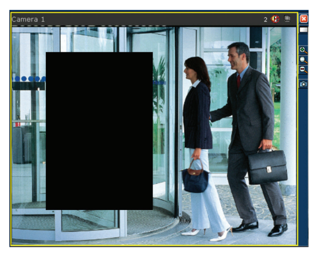
Area masked by Privacy Zones feature

Privacy zones feature for masking sensitive areas within live images