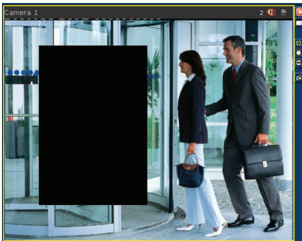
Fig. 3: Area masked by Privacy Zones feature